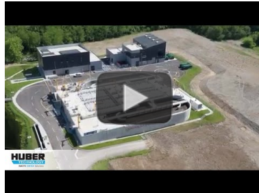
Video: HUBER Belt Dryer BT for high efficiency sewage sludge drying https://www.youtube.com/watch?v=PN7G-vk_r3c