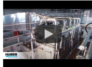
Video: HUBER Belt Dryer BT for medium temperature sewage sludge drying https://www.youtube.com/watch?v=7DzeODjrGXg