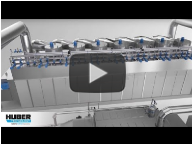
Sewage Sludge Drying with HUBER Belt Dryer BT https://www.youtube.com/watch?v=6VTJ1ex10bQ