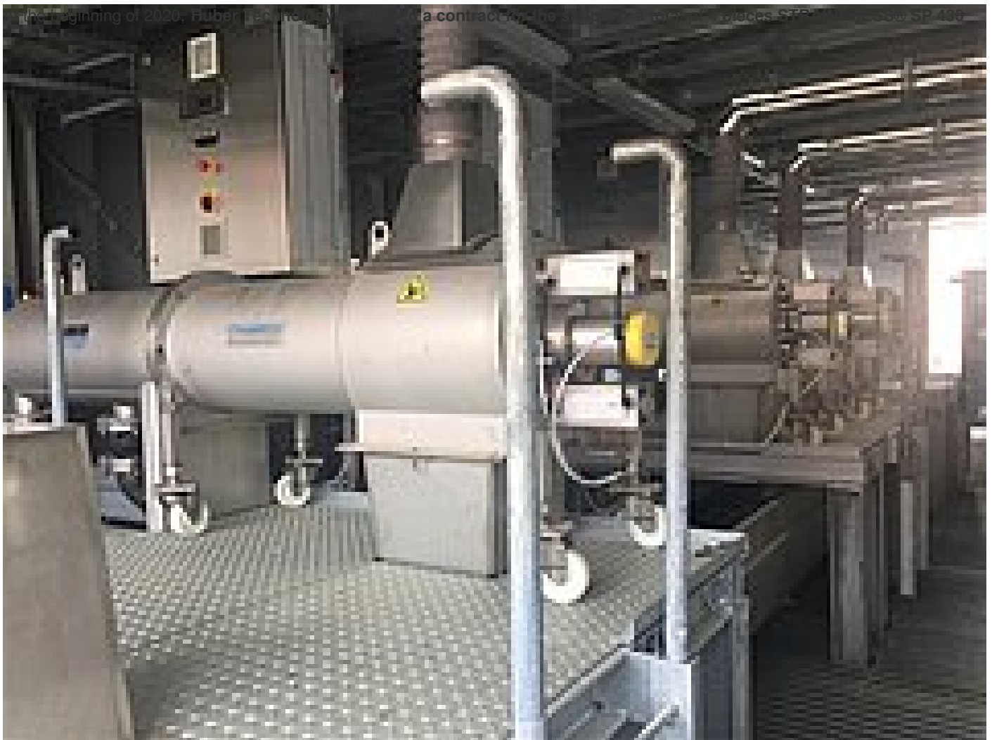
Series of STRAINPRESS® Sludge Screens installed at the East Rome WWTP.

The City of Rome has in total three major WWTPs which are all being operated by ACEA SPA. Due to major operating issues and maintenance cost caused by settlement and accumulation of high amounts screenings/solids inside the digestors, ACEA has approached HUBER to discuss the possibility to install a sludge screening system at the South and North WWTPs and to increase the existing capacities of Strainpress SP290 units at the East WWTP. The sludge line at these plants consists of pre-thickening followed by anaerobic digestion, post-thickening before the sludge is being dewatered via decanter centrifuges.