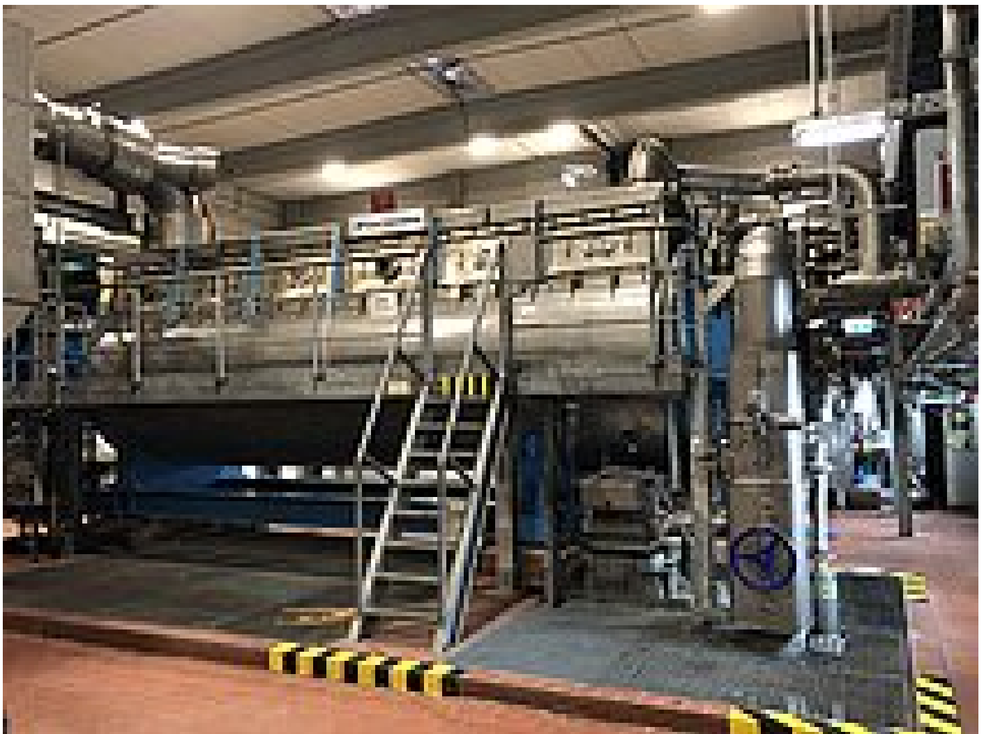
Figure 1: A disc dryer has been in operation at the Köhlbrandhöft sewage treatment plant in Hamburg for over 25 years

Disc drying technology has proven itself over decades for the partial and full drying of sewage sludge. For an effective application of disc drying systems and the use of waste heat, certain basic conditions must be taken into account.