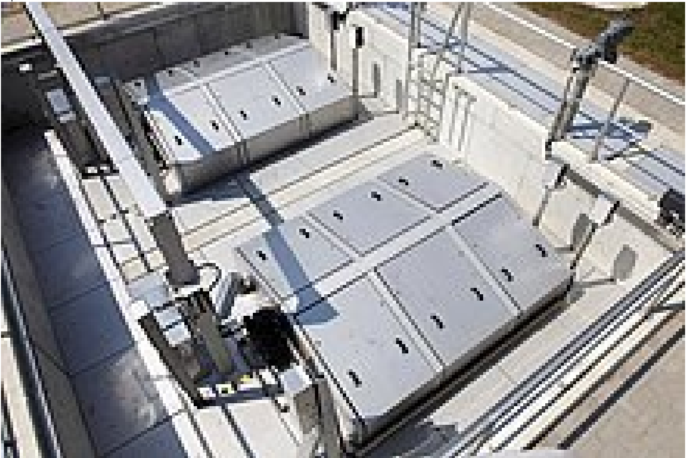
Fig. 2: Two RoDisc® 8 screens installed on STP Winsen an der Aller, Germany

the sludge floc through agglomeration, these are also removed from the wastewater through filtration. Normally, phosphorus effluent values below 1 mg/l can reliably be met with filtration and addition of a sufficient amount of precipitants in the upstream treatment stages, even effluent values below 0.5 mg/l phosphorus can be achieved.