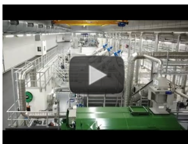
Animation: HUBER Complete Plant ROTAMAT® Ro5 HD

https://www.youtube.com/watch?v=BKPMhiNjmRI