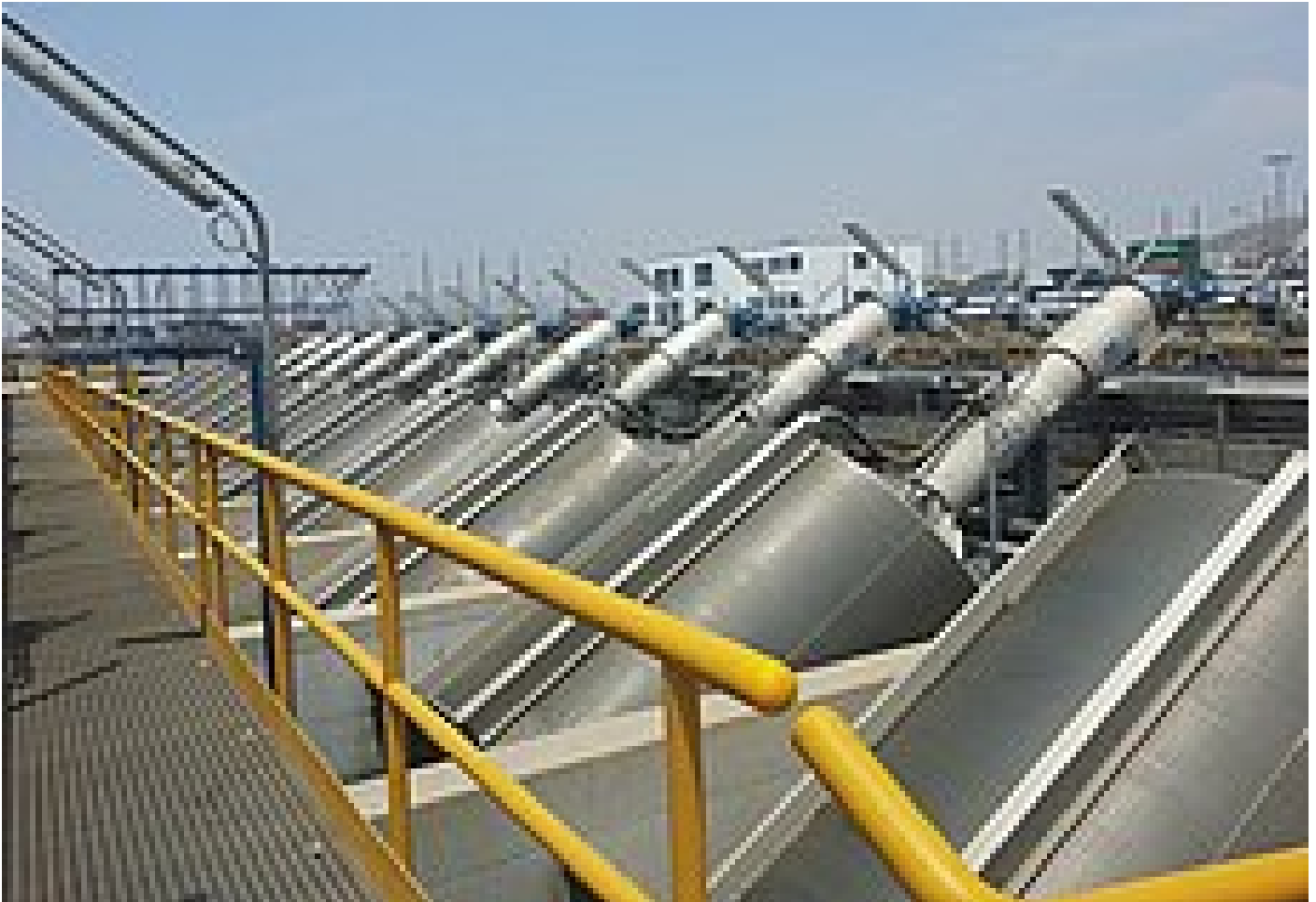
Several HUBER ROTAMAT® screens installed directly in the channel of the STP