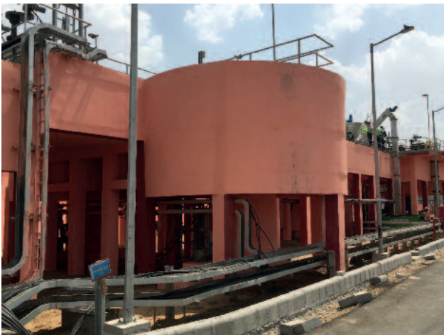
HUBER Vortex Grit Chamber VORMAX installation with HUBER Grit Washer RoSF4