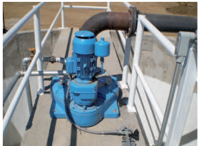
Reliable bull gear drive for the stirrer with airlift